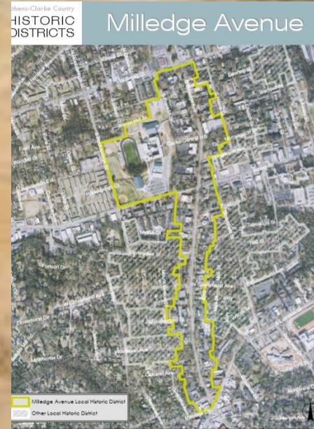
Present Day Milledge Avenue